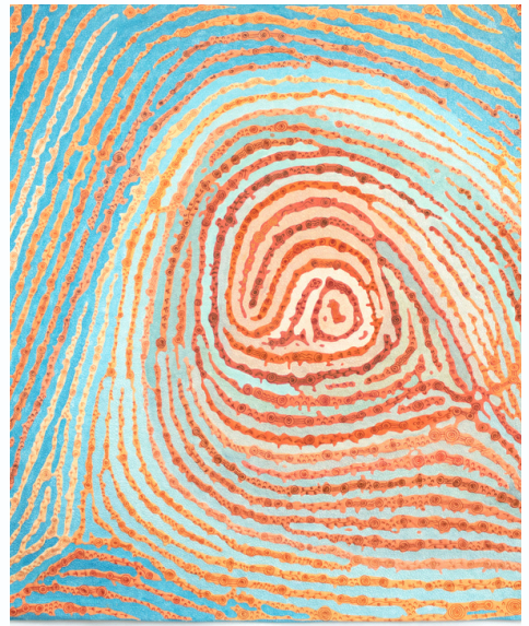
Sue Reid, Australian Print , 2019 (detail) hand painted with acrylic paints, hand embroidered and machine quilted. Cotton fabric, wool and polyester wadding, embroidery thread, 87 x 97cm Acquired as winner of 2019 Golden Textures, Collection of Central Goldfields Art Gallery © The artist and Central Goldfields Art Gallery

The next Golden Textures Art Award will be held at Central Goldfields Art Gallery in Maryborough in 2023.