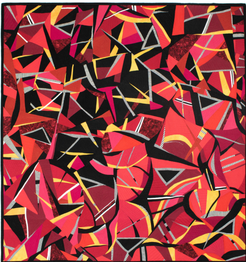
Cover image: Ruth de Vos, Banksia Spill , 2014 (detail) procion fibre reactive dyes, cotton homespun, cotton linen blend, cotton batting, 119 x 107 cm Acquired as winner of Golden Textures 2015, Collection of Central Goldfields Art Gallery © The artist and Central Goldfields Art Gallery

These works feature a strong sense of design, accomplished technique, and a dedication to a labour-intensive craft.