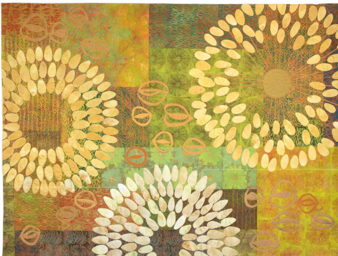
Susan Mathews, Coastal Life , 2013 (detail) quilted/sewn fabric, 108 x 148 cm Acquired as winner of Golden Textures 2013, Collection of Central Goldfields Art Gallery © The artist and Central Goldfields Art Gallery

With thanks to the team at Central Goldfields Art Gallery.